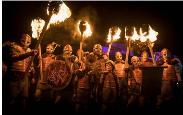
Up Helly Ae Festival