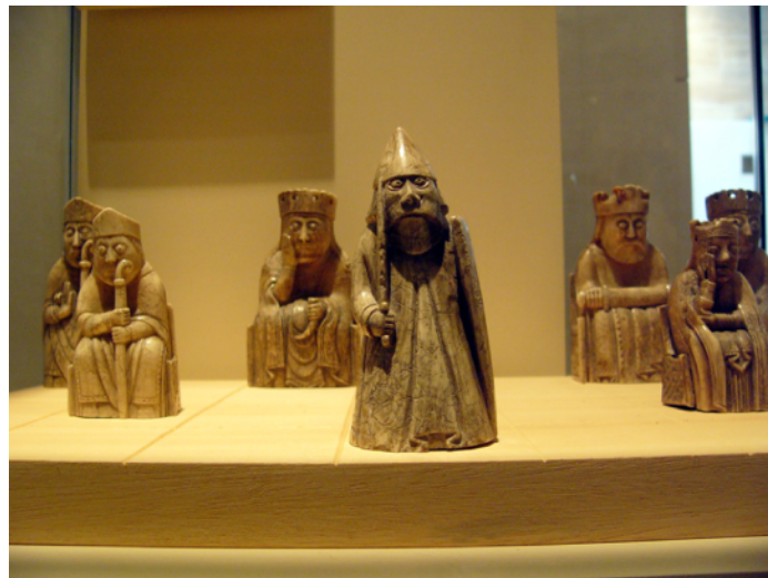
Lewis Chessmen on display in the National Museum of Scotland