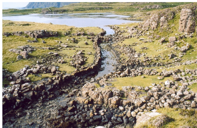
Viking Canal on Skye